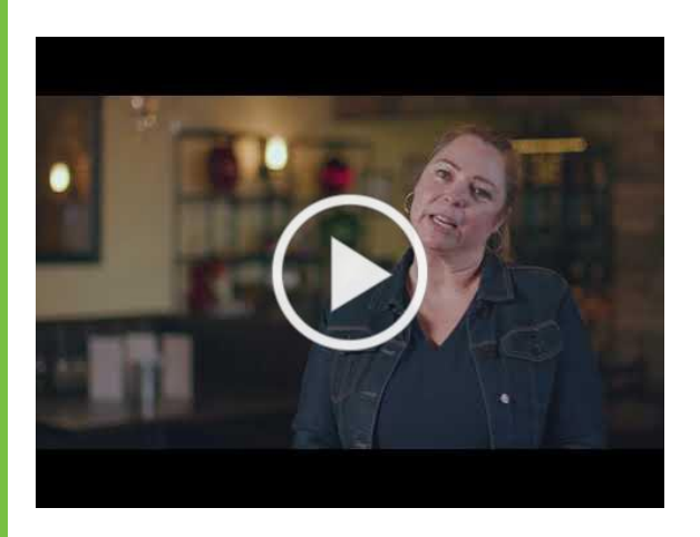
Porta Romana Restaurant reinvented itself to switch to a purely takeout model, where they were able to keep the community fed and happy. □