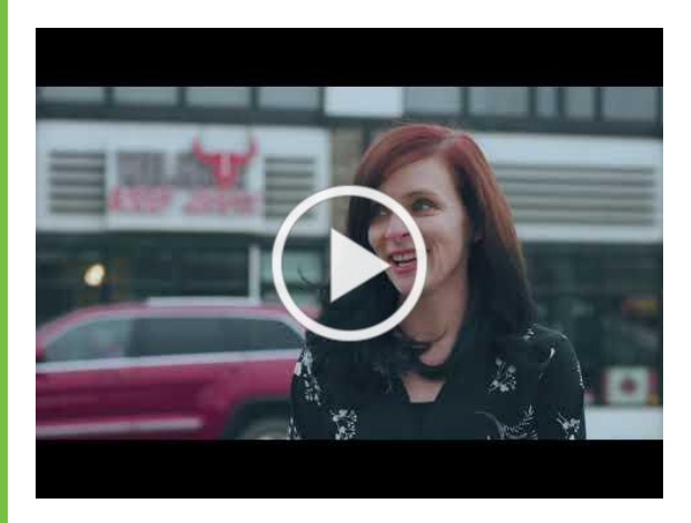
Wilhauk Beef Jerky found innovative ways to change its business model and support local businesses. □

Over the past year, we saw incredible examples of resiliency and recovery within our community. We are proud to share some of these stories through a video series called "Spruce Grove Recovers".