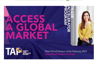
This program helps small