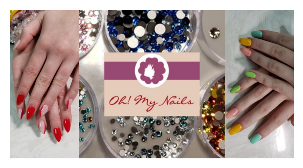
<u>Oh! My Nails</u> offers manicure and pedicure services. Book an appointment to visit them on McLeod Avenue for the ultimate pampering experience!

Visit the new <u>Broadway & Grand</u> location on St. Matthews Avenue. Place a take-out order to try their gourmet appetizers, sandwiches, or burgers. □