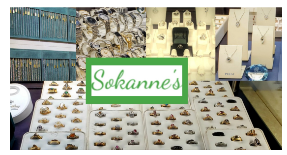
Sokanne's continues to offer an eyecatching selection of jewelry and giftware. Visit them on King Street for your sparkling needs!

Laberge Engraving & Gifts preserves memories with personalized engravings. Support them on King Street to design a perfect keepsake for any event. □