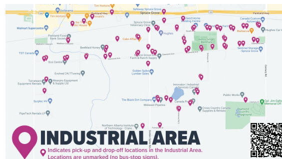
INDUSTRIAL AREA Indicates pick-up and drop-off locations in the Industrial Area. Locations are unmarked (no bus-stop signs).

Need a ride to work? With 200+ pick-up/drop-off locations (including 71 in our industrial area), getting to work has never been easier. Spruce Grove's on-demand local transit can get you there for $3/ride.