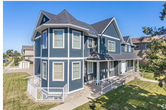
203 Church Road

Main Street Law LLP has expanded by acquiring the office building formerly occupied by Seal & Bedard Accountants at 203 Church Road. This is in addition to the Main Street Law offices at #12, 119 First Avenue bringing their total office space in Spruce Grove alone to over 16,000 SF. Main Street Law also added another location in 2021 as they expanded their reach to Drayton Valley with a satellite office, and they have had a satellite office in Edmonton on 124th Street since 2008.