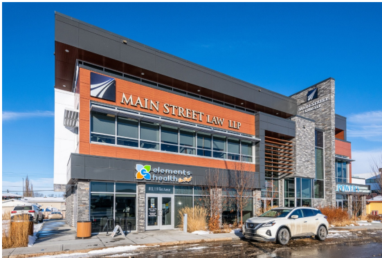
#112, 119 First Avenue